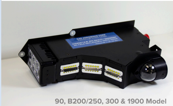
90, B200/250, 300 & 1900 Model