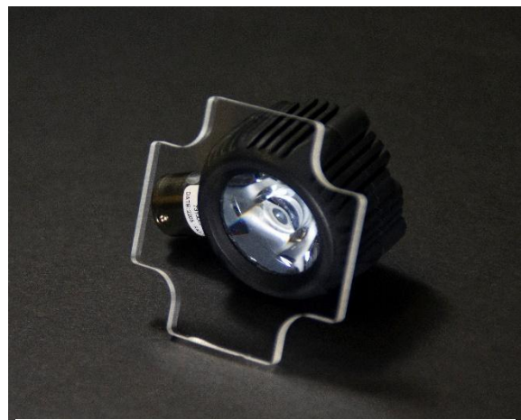
PWI's Ice Light Window

The Ice Light Window is constructed of durable, lightweight, plexiglass material. Combined with PWI's LED Ice Light, the Ice Light Window will save aircraft down time as well as being less expensive over the life of the aircraft.