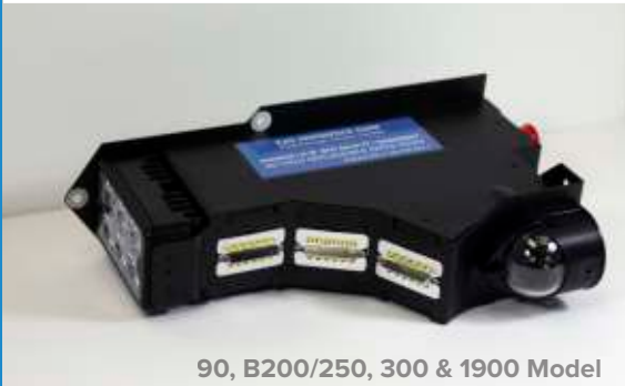
90, B200/250, 300 & 1900 Model